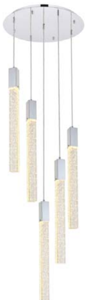
Chrome Item No: 2066D20C