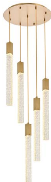
Stain Gold Item No: 2066D20SG